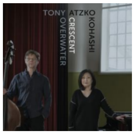
Released by Jazz in Motion, 2022

*Crescent was nominated for Edison Jazz Jury Award (National category) 2022 and Der Preis der deutschen Schallplattenkritik (The German Record Critics' Award) 2/2022